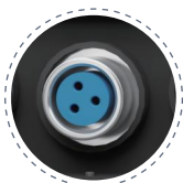
4 pins, for temperature/ cond probe