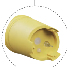
Default probe: DORP1-S