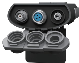
Silicone protective caps