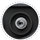
8 pins, for DO probe