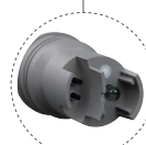
Default probe: DPC1-S