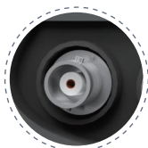
BNC, for pH/ORP probe